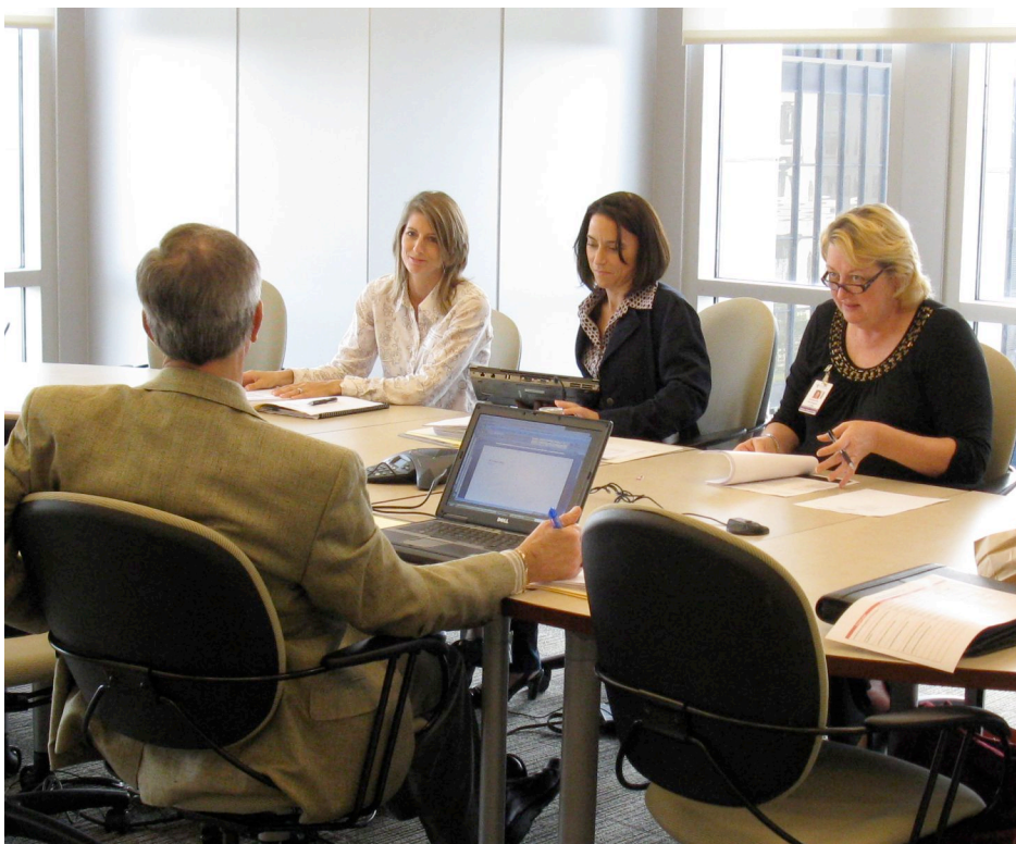
The Behavioral Health Professionals Working Group began meeting last year. The group struggled to develop compromise language for new legislation.