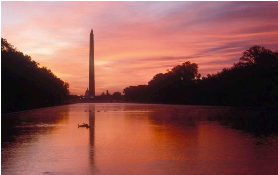
Washington Monument